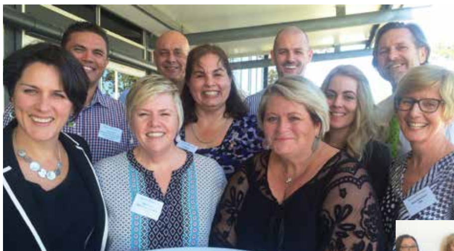
Members of the CISS Executive

Last month, 100 leaders from Community, Indigenous and Subacute Services gathered for a planning day at Victoria Park Golf Course to begin the journey of designing how we can better meet the challenges that Metro North has in responding to increasing healthcare demand.