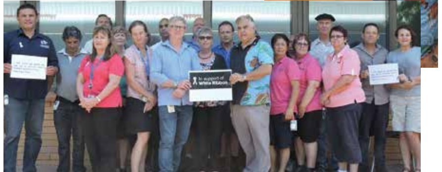
Staff from Community, Indigenous and Subacute Services take the oath at Chermiside Community Health Centre