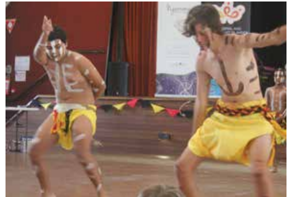
Deadlee Maarders dance group