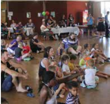
Guests at Ngarrama Family Day

The event featured dancing from Aboriginal dance troupe the Deadlee Maarders, Miriam Giz dancers from the Torres Strait Islands, art workshops, storytelling and health promotion.