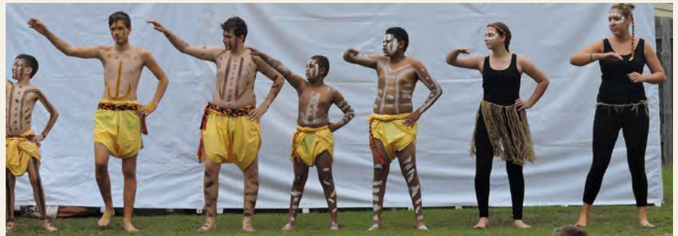
Above: Deadly Maarders dance crew.