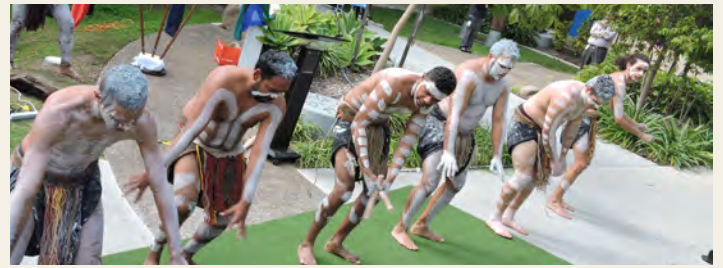
The Guruman Dancers.