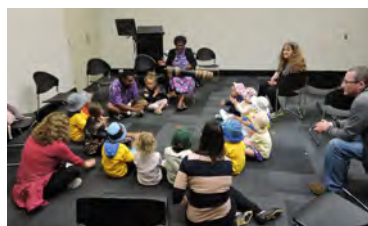
Children from Lady Ramsey childcare centre learn traditional Torres Strait Islander songs.

The Indigenous dancers from Morton Bay and The Wagga were a highlight for guests, along with a traditional BBQ featuring emu, crocodile and kangaroo sausages.