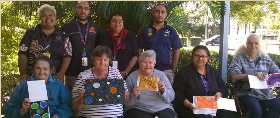
Members of Adult Health team with some of our clients / Reconciliation Week display at Pine Rivers Community Health Centre

The feedback was very positive and it was good to hear how the work of the team makes a difference in the lives of those who receive our services.