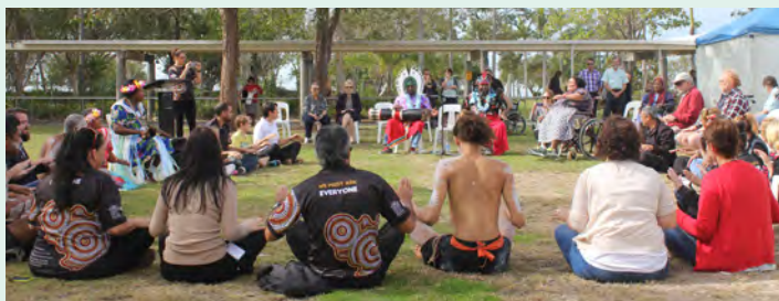
Staff, patients and the Executive took part in the “Taba Naba” dance.