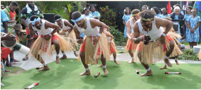
The Wagga Dancers.